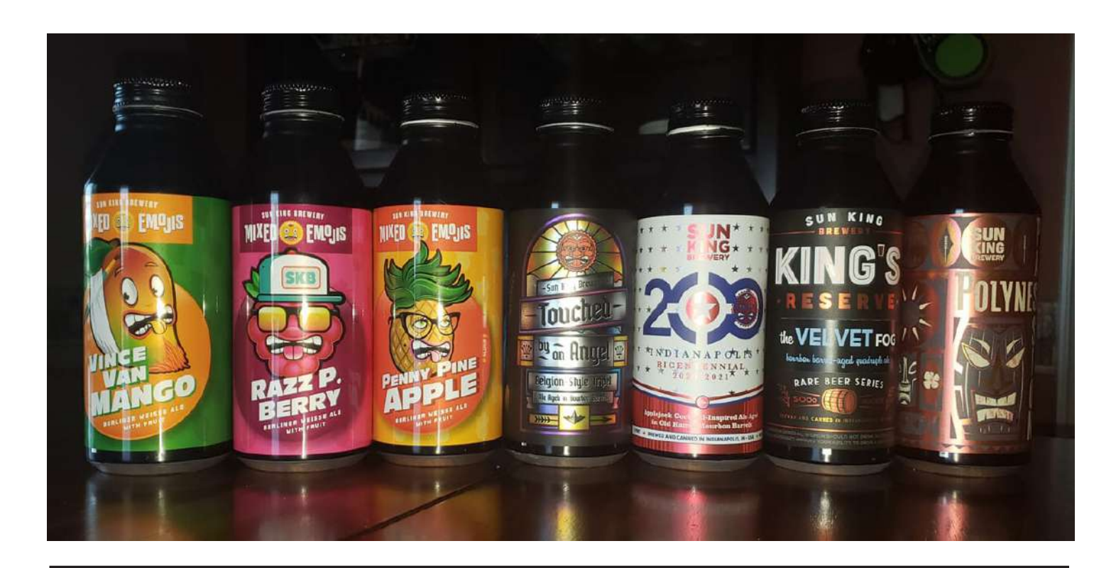
Sun King Brewery