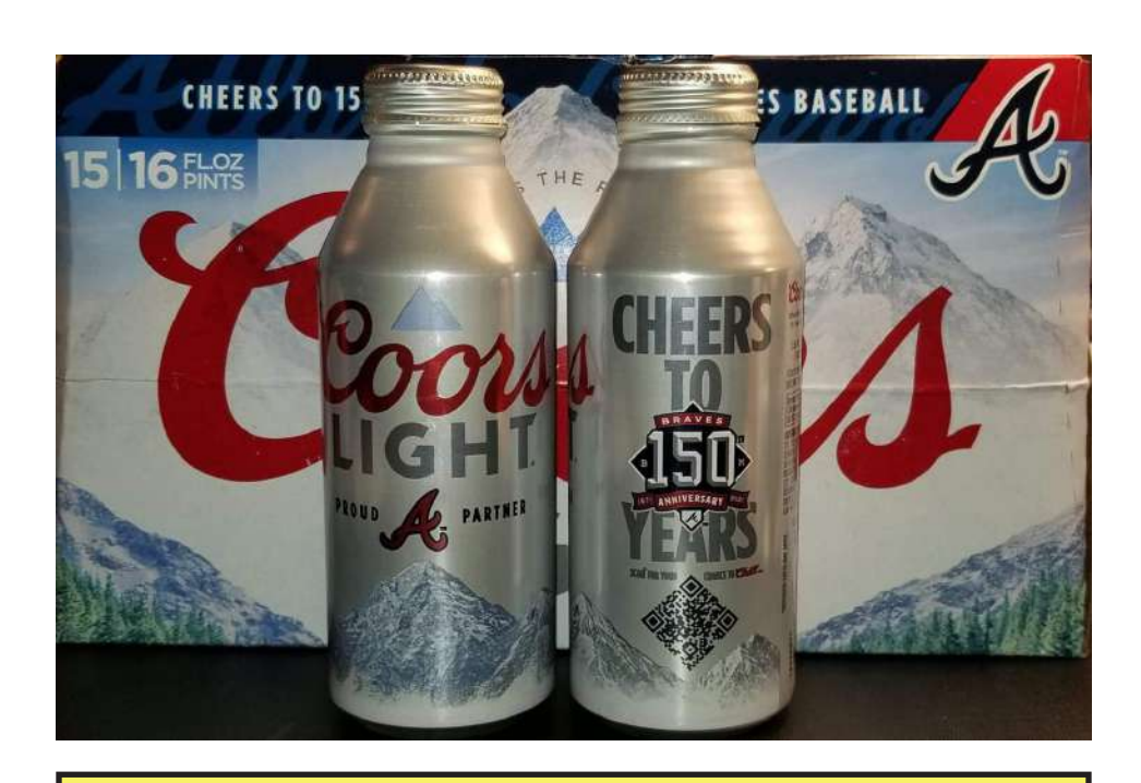
Coors Light commemorating Atlanta Braves 150th Anniversary