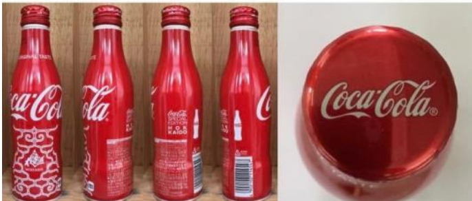
JAPÓN 2021 Coca-Cola HOKKAIDO (4ª versión) +S4/B25LG 2022#01#