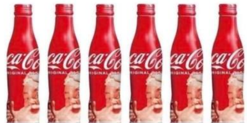
JAPÓN 2021 Coca-Cola NAVIDAD