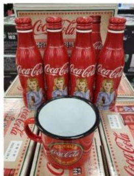
KOREA DEL SUR 2021 Coca-Cola