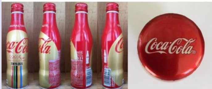
JAPÓN 2021 Coca-Cola JUEGOS OLÍMPICOS TOKIO 2020 Edición Especial 2021 +54 / FO6NG 2022#05#