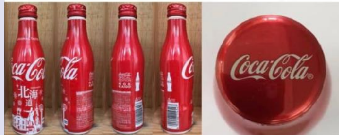
JAPÓN 2021 Coca-Cola HOKKAIDO (5ª versión) +S4/B25LG 2022#01#