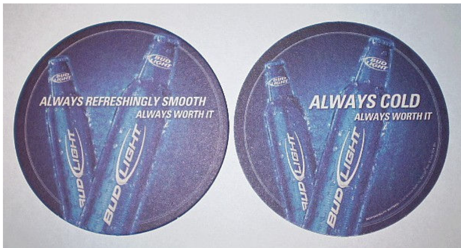
Aluminum Bottle coasters always make good 'Go-Withs' Thanks to Peggy Papas ABC# 138