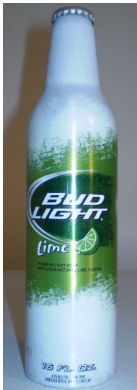
Bud Light Lime 501553