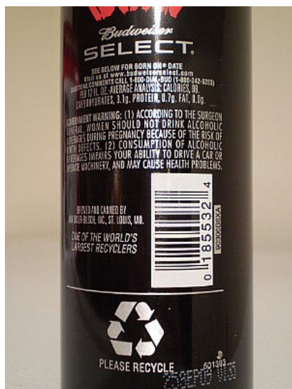
Bud Select 501393 16oz non-redem