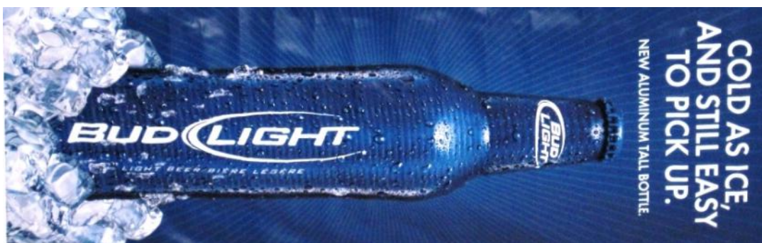
Bud Light banner from a few years back, an oldie but a goodie....

For more info on any of these shows go to BCCA.COM or check your latest issue of Beer Cans and Brewery Collectibles.