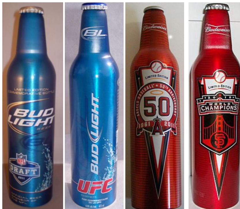
Bud Light NFL Draft 500452 16oz redem

There were a few designs floating around for several Tilt aluminum bottles. Nothing has happened with that yet and instead of starting more unfounded rumors, we'll see if they "Really" happen to get released.....