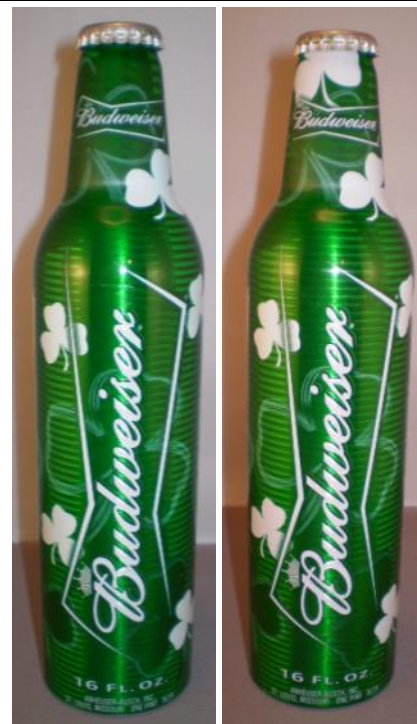
Budweiser 'St Pats' Day

Budweiser has two baseball bottles out so far. The first is for the Anaheim Angels 50th anniversary, 1961-2011. Bottle has a real similar design to all the bottles we've seen in 2009 and 2010. The next is a second bottle for the Giants World Series victory. The