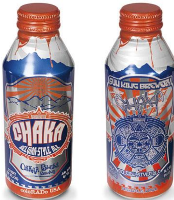
Chaka, a limited release Belgian-style ale by Oskar Blues Brewery and Sun King Brewing Co is brewed by both companies and packaged in similar but distinctive company-branded Alumi-Tek bottle by Ball.

Oskar Blues is a pioneer in the craft canning movement as the first American craft brewery to can their beer with the release of Dale's Pale Ale in 2002. They have grown to become the largest American craft brewery to package beer exclusively in cans, producing 59,000 barrels of beer in 2011.