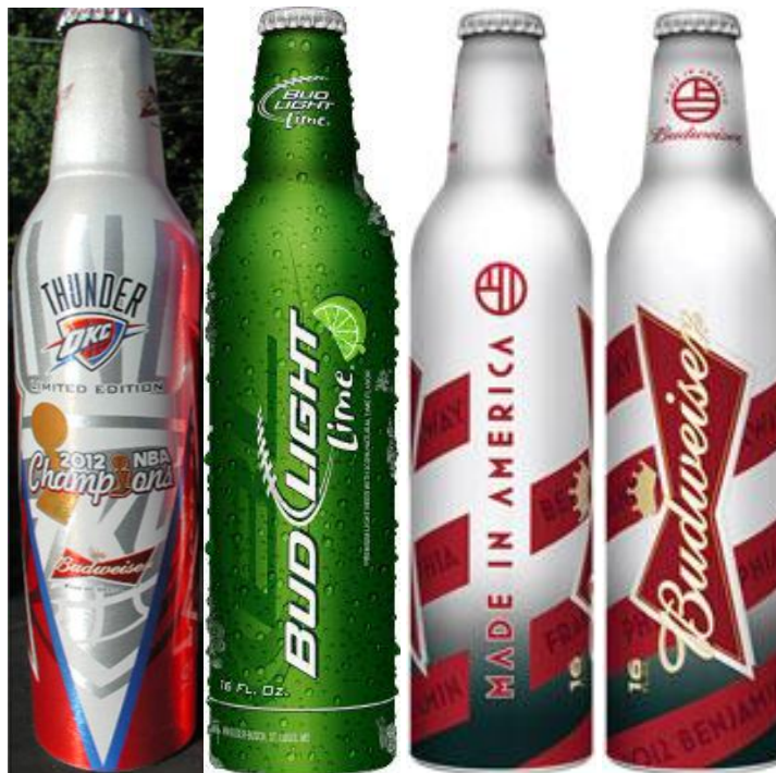
Budweiser OKC Thunder

Finally another one to be on the lookout for from Budweiser. The Made in America bottle should also be a national release and once all the Olympic bottles start to disappear from the store shelves, these should roll in.