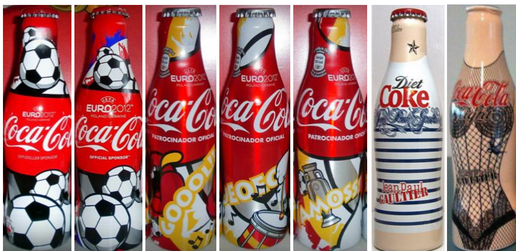
Austria, Coke UEFA