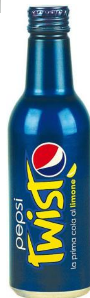
Italy, Pepsi Twist