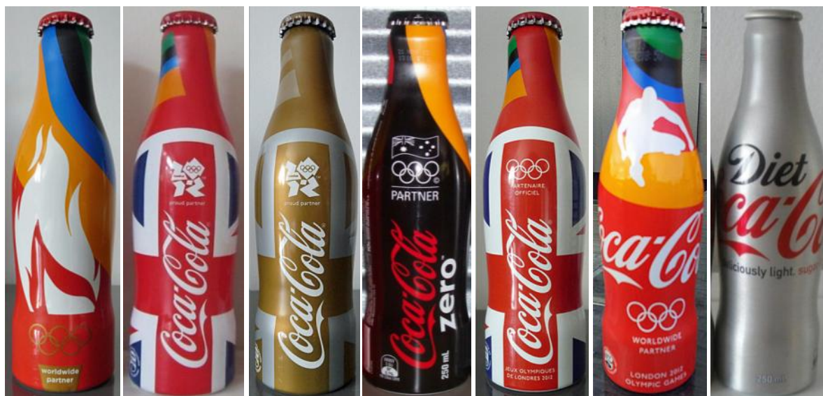
UK, Coke Olympic Torch Relay

With the Olympics coming up and the recent UEFA Soccer Championships in Poland, it has been like opening up the floodgates for new Coke releases. Not being a collector of soda bottles I find it somewhat hard to keep track of all these. The ABC Chapter website is kept somewhat updated and is the place to go for more information on any bottle. Just for the purpose of quick identification and to give you an idea of what's out there, listed below is just a sample of some of the international bottles released/being released this summer.