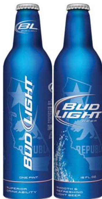
Bud Light California