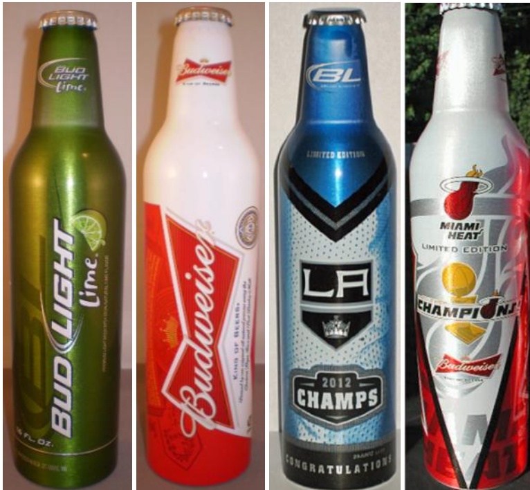
Bud Light Lime